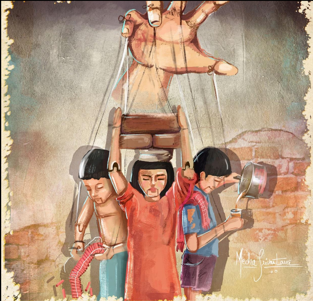
Puppets Of Poverty. #stopchildlabour #cutthestrings